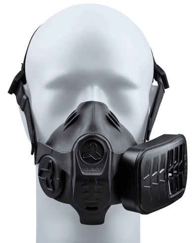
Integrated utility port provides the capability to seamlessly connect communications equipment.