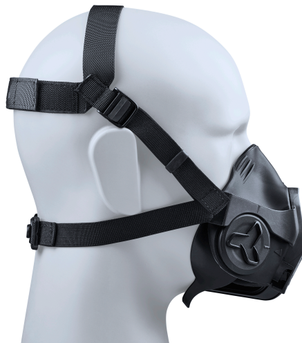
Chinstrap integrates with helmet so no need for a helmet chinstrap extender.